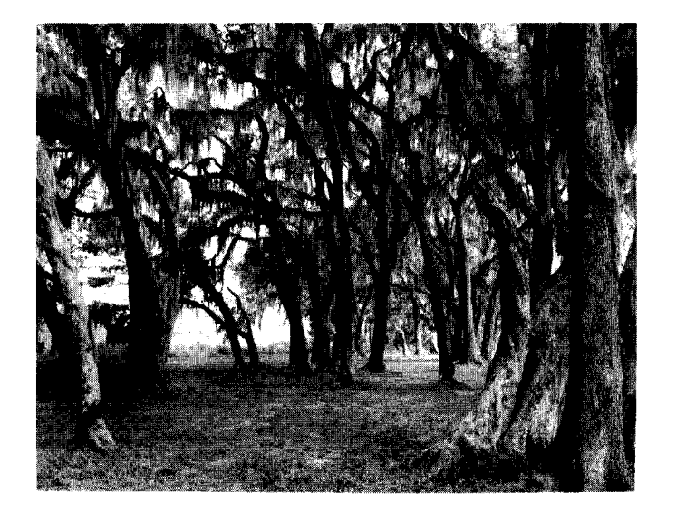
Figure 2-A stand Of live oak on Jekyll Island along the Georgia coast.