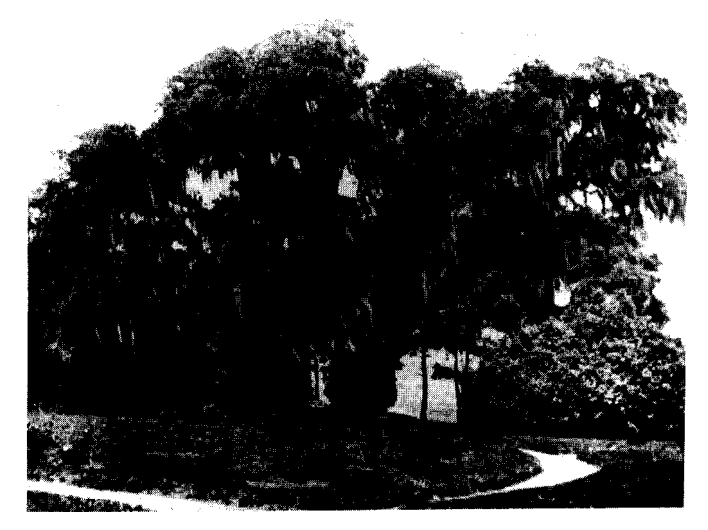
Figure 3-Live oak, 500 to 700 years old, in South Carolina.

Rooting Habit-There is no published information on rooting habits, but the ability of live oak to grow and mature on sites subject to hurricane-force winds suggests that it is a deep-rooted species.