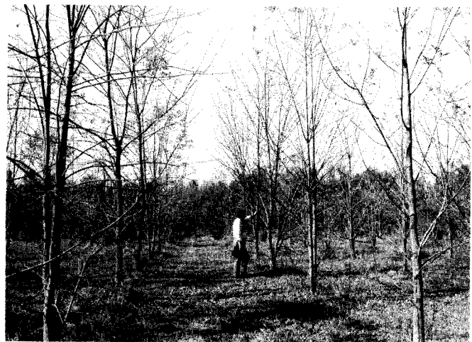
Figure 4-Five-year-old plantation-grown green ash.

Rooting Habit-Root systems were studied in North Dakota on a Fargo clay soil, with a 0.3-m (1-R) layer of black surface soil overlaying a light-colored, calcareous, clayey soil with no hardpan (25). The soil