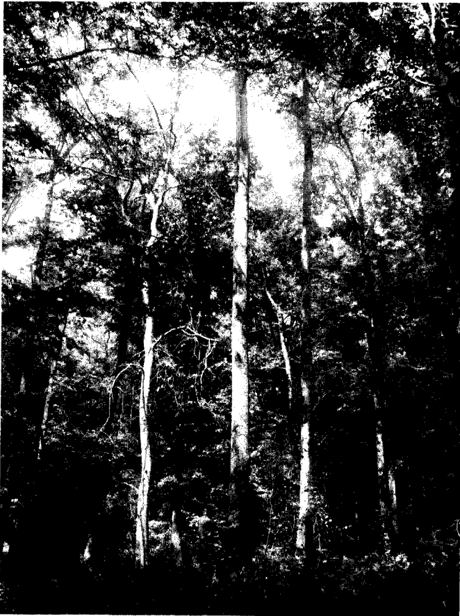
Figure 3-A good natural stand of green ash on Falaya-Waverly soil.

Little data exist on growth rates and volumes of trees grown under natural stand conditions. Probably the best information available is contained in results of research conducted in Georgia (6). Four sites included in the study ranged from well-drained sandy loams on levees or terraces to poorly drained, wet, silty flats. Green ash was the dominant species in these stands, comprising about 80 percent of the total stand basal area. Stand ages ranged from 27 to 65 years. Average stand heights for green ash sawtimber ranged from 24 m (78 ft) in the 27-year-old stand to 35 m (116 ft) in the 65-year-old stand.