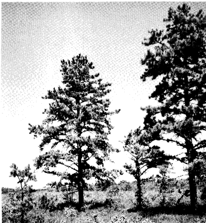
Figure 2—Open-grown pitch pine in Berkshire County, MA.

is 2.5 cm (1 in) in 5 years at 20 years of age, and falls to 2.5 cm (1 in) in 8 years at 90 years (9).