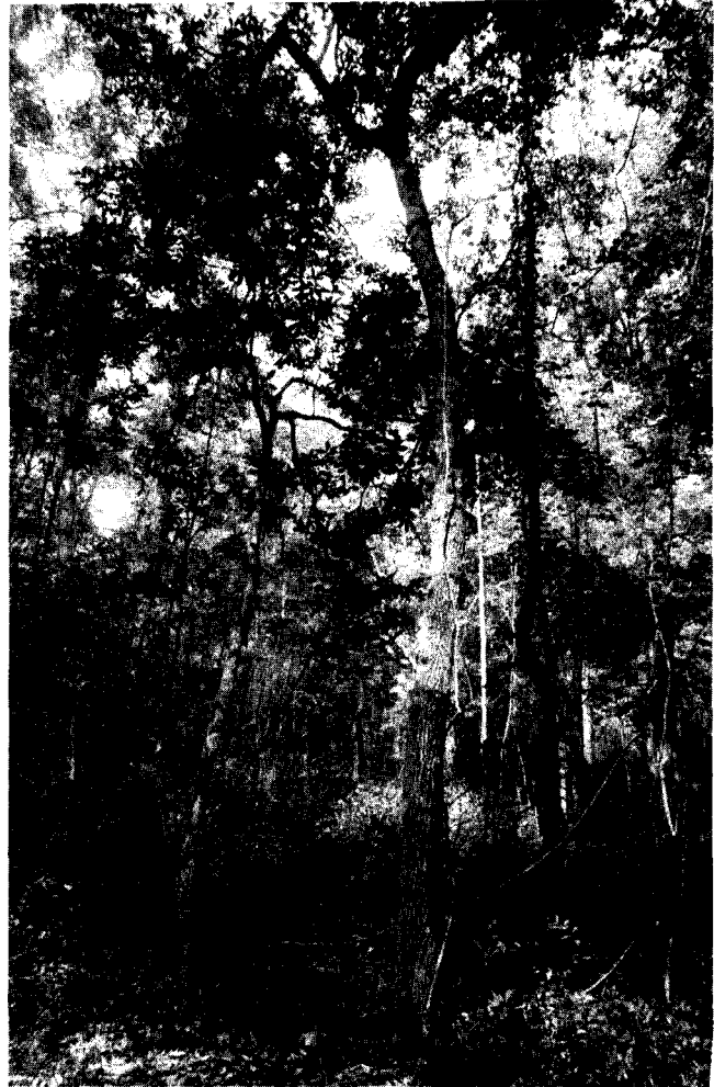
Figure 2 —Two stems of redbay, one overtopping another on the edge of a Dorchester County swamp in South Carolina.

In the forest cover type Sweetbay-Swamp Tupelo-Redbay (Society of American Foresters Type 104), redbay is a major component (1). Stocking within this type may consist of combinations of any two or all three of these species, but locally a single species may dominate. It is a common associate of the fol-