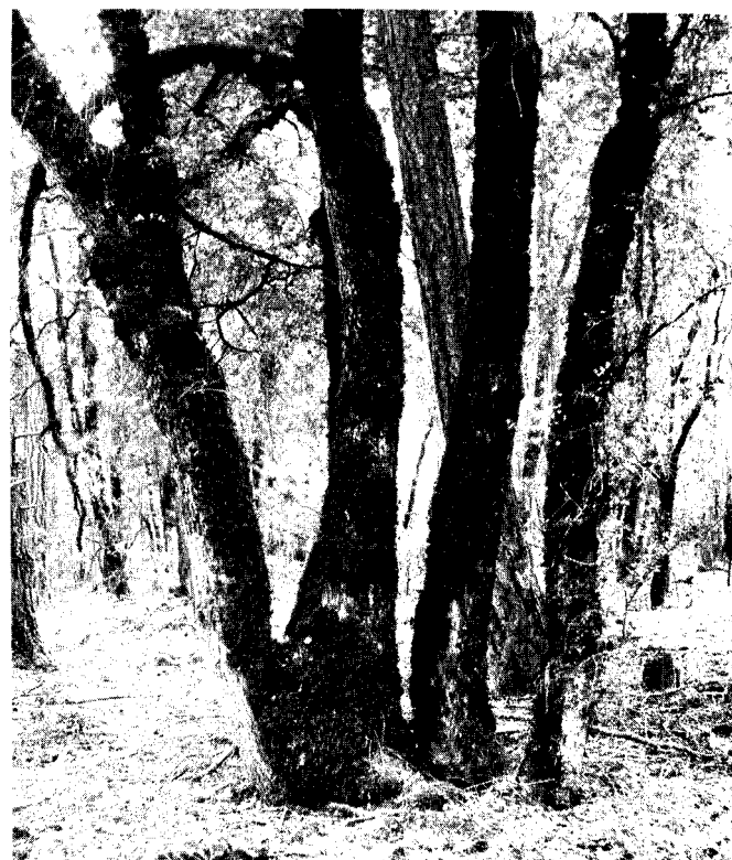
Figure 2 —Clumps of canyon live oak originating from sprouts in a 70-year-old canyon live oak-Douglas-fir stand.

Vegetative Reproduction-Canyon live oak reproduces by sprouts that develop from dormant buds under the bark at the base of trees. Sprouts may form after a minor injury, such as browsing, or