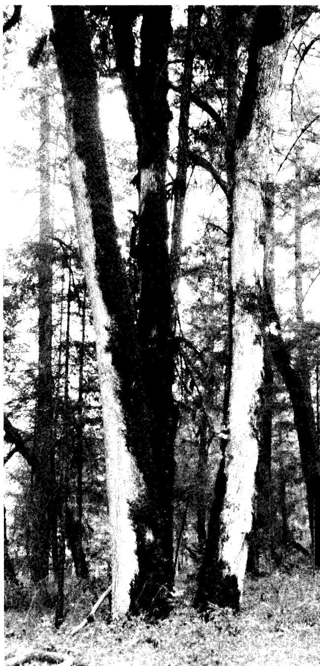
Figure 3 —Large canyon live oak and Douglas-fir in the Pseudotsuga menziesii - Quercus chrysolepis / Rhus diversiloba type of the mixed evergreen forests in northern California.

vigor of the parent tree or shrub determine the early height growth and number of sprouts per clump. Sprout development is greater on larger, more vigorous parent trees. Sprout growth of 0.5 to 1 m (1.6 to 3.3 ft) has been measured the first year. The