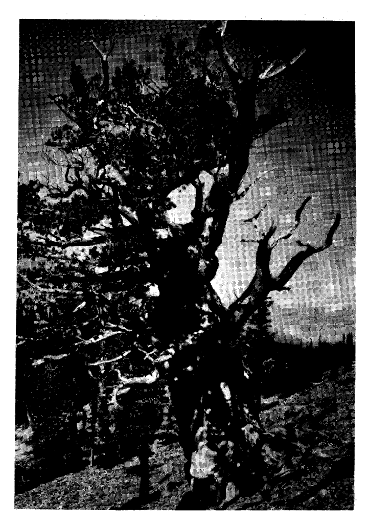
Figure 2—A monarch limber pine at 2896 m (9,500 ft) in the Lost River Range of east central Idaho. The contorted branches, wind-sculptured bole, and barren site attest to the severe environments that this species can endure.