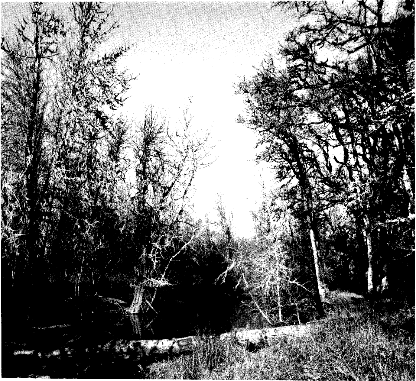
Figure 2 -Oregon ash along a stream in the Willamette Valley, OR. Oregon white oak, a common associate, is present on the right side of the stream.

8 m (25 ft) tall and 15 to 20 cm (6 to 8 in) in d.b.h. (22).