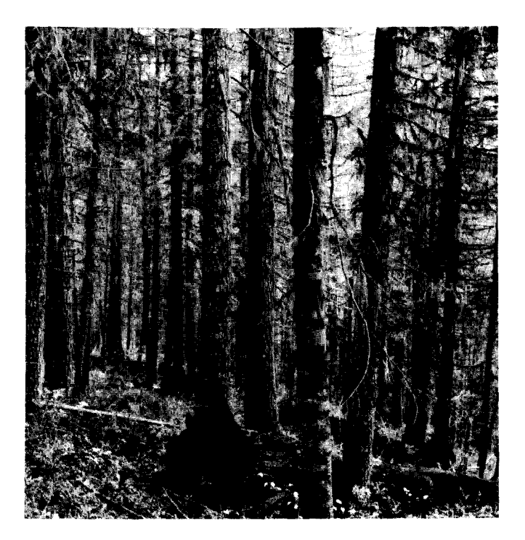
Figure 3-A 90-year-old grand fir stand. Coeur d'Alene National Forest, ID.

Grand fir has been planted successfully in many European countries, where it is considered one of the most potentially productive species (2). In England, growth of grand fir plantations was compared with that of neighboring plantations of other commonly planted species, and the rate of growth of grand fir at 40 years of age frequently equaled or exceeded