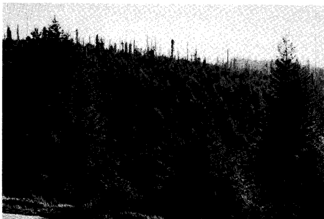
Figure 4-A young redwood stand with some Douglas-fir on an area from which almost all trees and snags have been removed.

redwood forest land is classified as highly productive, and only 2 percent is poor for growing trees. Flats along rivers have yielded approximately 10 500 to 14 000 m 3 /ha (about 750,000 to 1,000,000 fbm/acre) in scaled logs. Harvest cuttings in Del Norte County, CA, on units of 5.3 ha (13 acres) and larger, produced gross volumes ranging from 1330 to 3921 m 3 /ha (95,000 to 280,000 fbm/acre, Scribner).