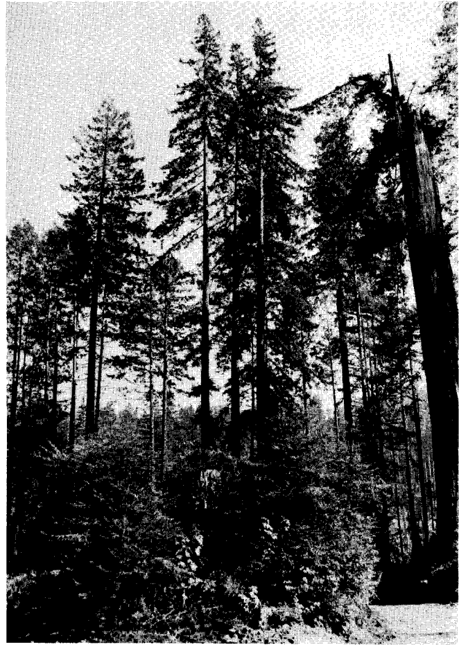
Figure 2—Redwood sprouting in an area cut 2 or 3 years earlier. New sprouts around a stump are shown in foreground; center background is filled with a cluster of young trees from sprouts.

Redwood can sprout from stumps and root crowns anytime of the year (fig. 2). Numerous and vigorous sprouts originate from both dormant and adventitious buds within 2 to 3 weeks after logging. Sprouting capacity is related to variables associated with tree size or age. Stumps of small young trees