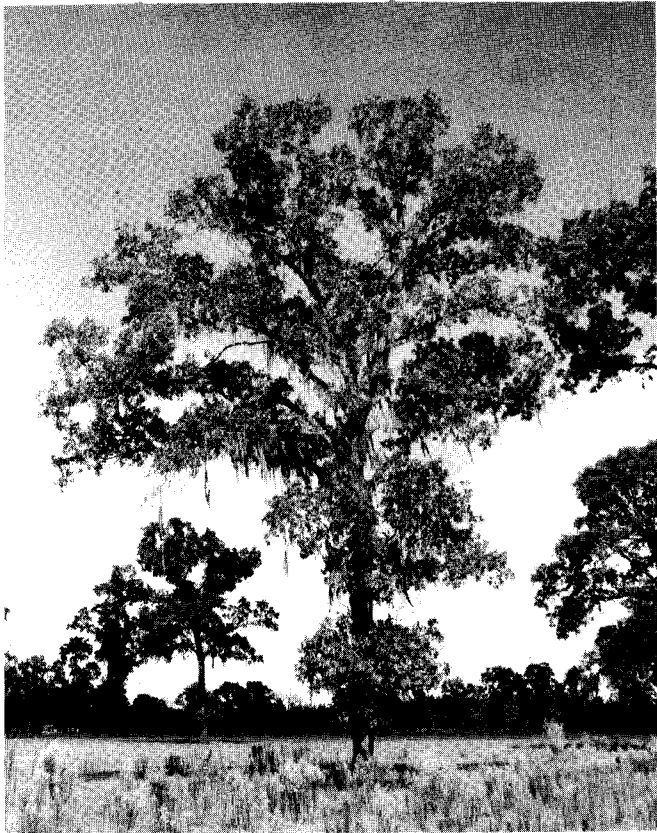
Figure 2—Turkey oak.

oak grows on approximately 3.5 to 4 million ha (9 to 10 million acres) of land in Florida alone (27).