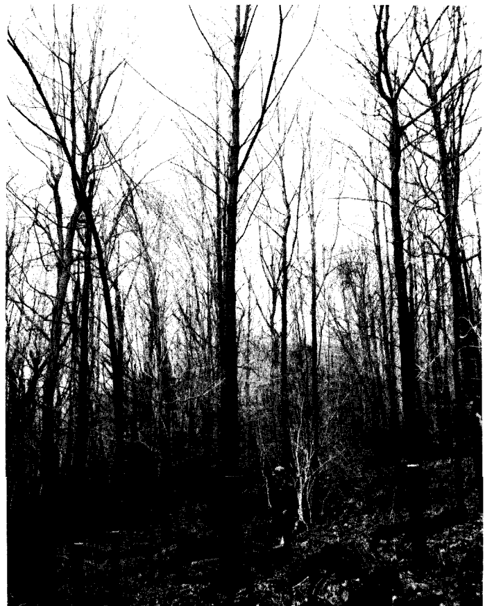
Figure 0 —Twenty-year-old pin cherry trees on the Fernow Experimental Forest, near Parsons, WV.

Twenty-five species of nongame birds, several upland game birds, fur and game mammals, and small mammals eat pin cherry fruit. Buds are eaten by upland game birds, especially sharp-tailed and