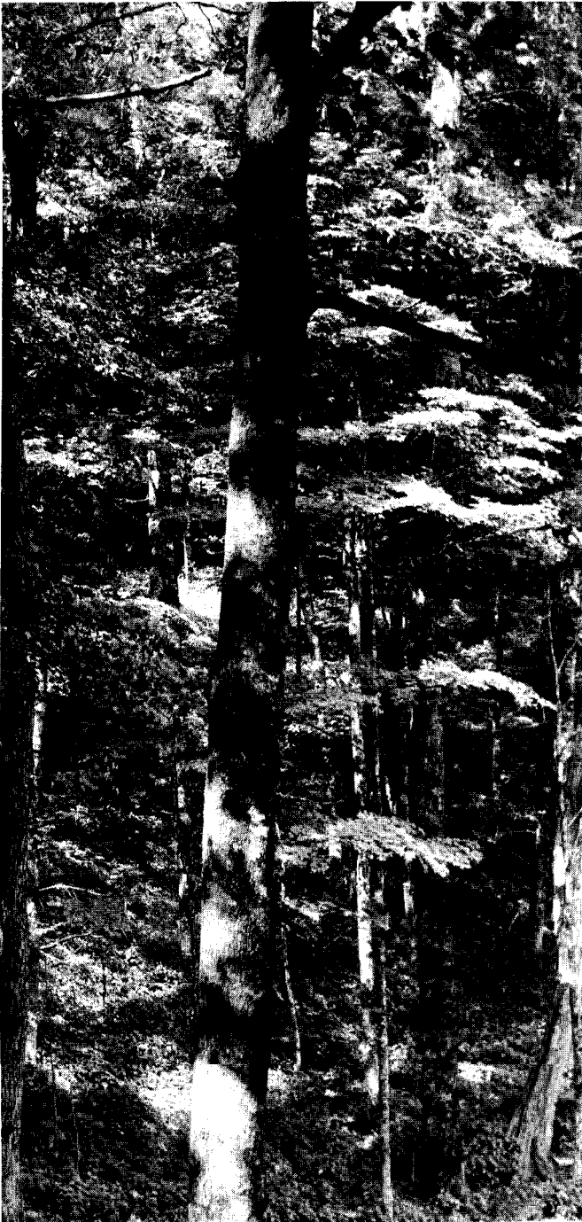
Figure 2-A yellow buckeye among cove hardwoods in North Carolina.

southeastern Illinois; south to Kentucky, central Tennessee, and northern Alabama; east to northern Georgia and extreme northwestern South Carolina; and north to western Virginia and West Virginia (7).