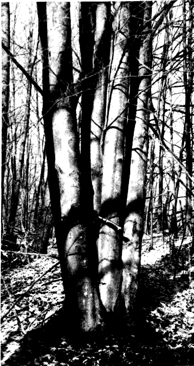
Figure 3-Clump of red maple stump sprouts.

ry leaves have been identified as a source of benzoic acid and as a potential allelopathic inhibitor of red maple (23).