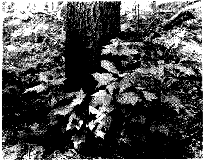
Figure 4-Red maple sprouts at base of tree 30 cm (1.2 in) in d. b. h. 2 months after a prescribed burn.

Vegetative Reproduction-Red maple stumps sprout vigorously (figs. 3, 4). Inhibited, dormant buds are always present at the base of red maple stems. Within 2 to 6 weeks after the stem is cut, these inhibited buds begin to extend (65). Fire can also stimulate these buds. The number of sprouts per