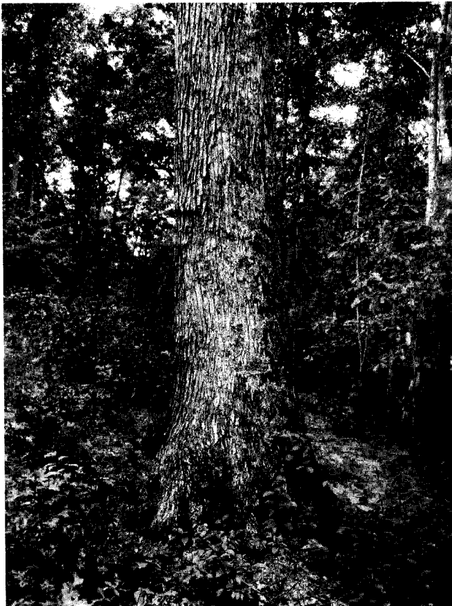
Figure 2—Mature red maple.

Red maple (figs. 1, 2) is one of the most abundant and widespread trees in eastern North America (26). It grows from southern Newfoundland, Nova Scotia, and southern Quebec to southern and southwestern Ontario, extreme southeastern Manitoba, and northern Minnesota; south to Wisconsin, Illinois, Missouri, eastern Oklahoma, and eastern Texas; and east to Florida (33). It has the greatest continuous range