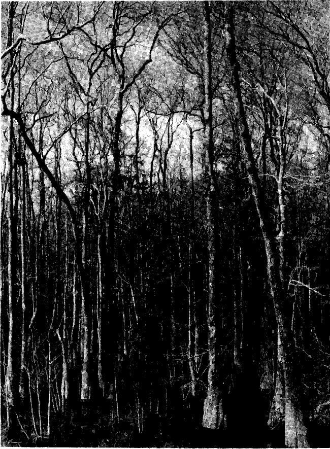
Figure 3-A swamp tupelo in the lower Coastal Plain of South Carolina.

Mississippi Valley to southern Arkansas and west and south Tennessee (17).