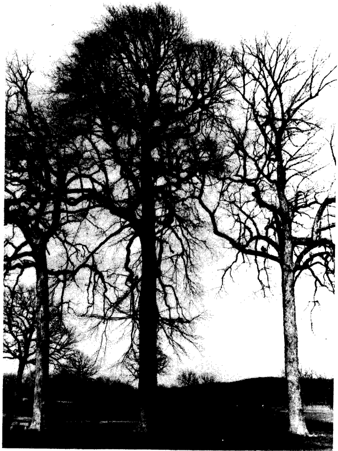
Figure 2— Black tupelo (center).