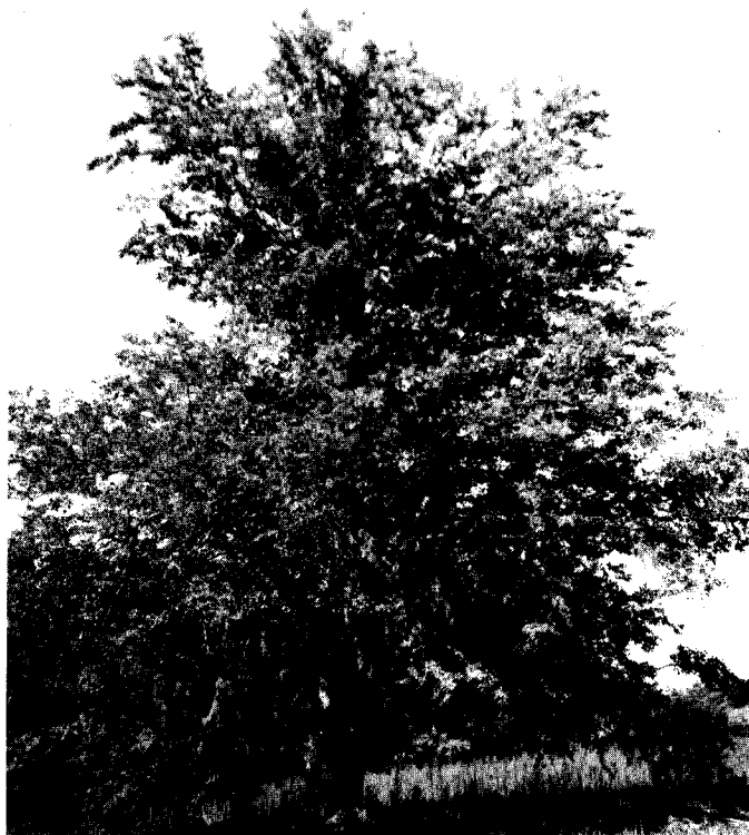
Figure 2-A medium-sized open-grown sugarberry tree in Louisiana.

southern Illinois, southern Indiana, and western Kentucky. It is local in Maryland, the Rio Grande Valley, and northeastern Mexico. Its range overlaps the southern part of the range of hackberry ( C. occidentalis ).