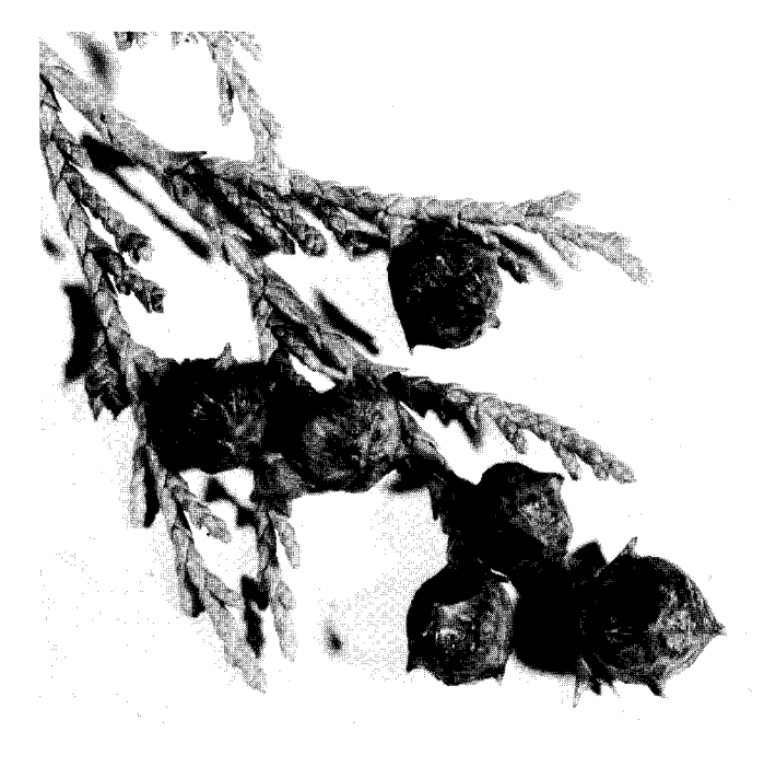
Figure 2-Mature cones of Alaska-cedar.

Formation of both pollen cones and seed cones can be induced in juvenile trees by foliar application of gibberellin- A_3 under conditions of long day length. Cones induced by gibberellin- A_3 yield higher percentages of filled seeds with higher rates of germination than cones that develop under natural conditions. Seed orchards should offer the opportunity for treat-