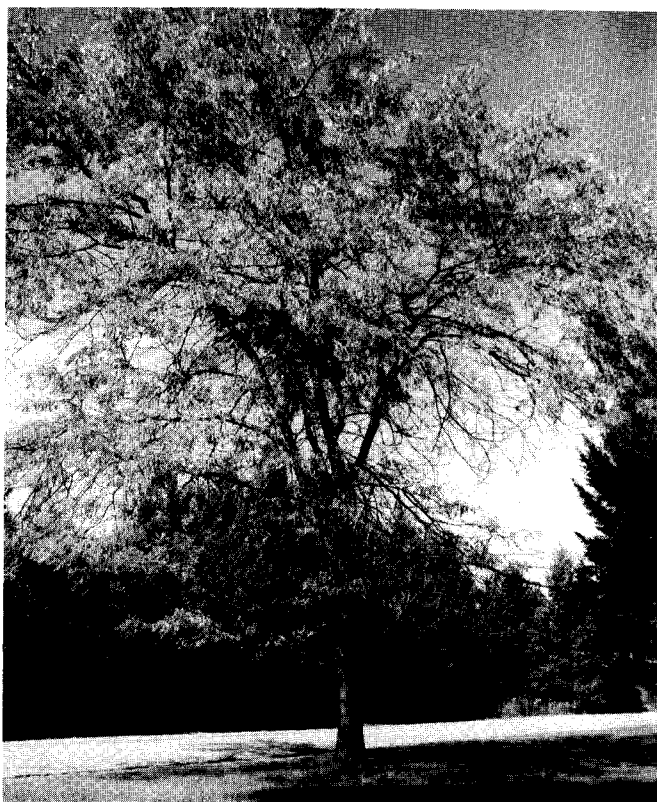
Figure 2-Winged elm.

lahoma and southeastern Texas; and east to central Florida. It is also found locally in Maryland (10,14).