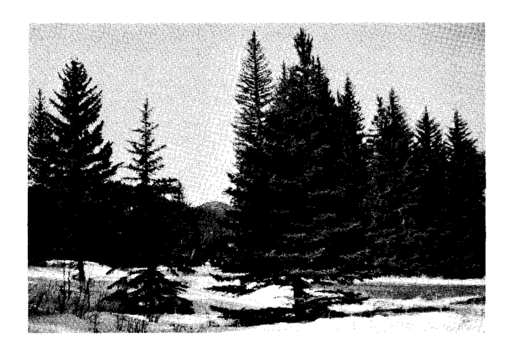
Figure 2—Stand of blue spruce.

but on streamside sites it is often the only coniferous species present.