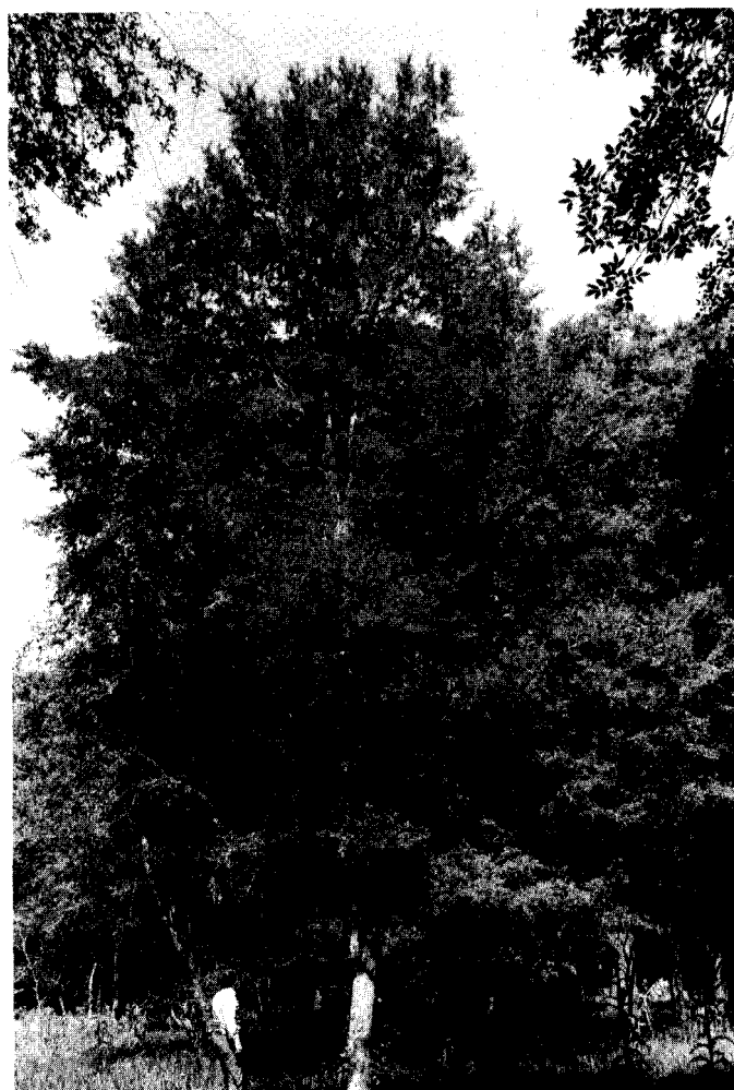
Figure 2 —Cedar elm growing with other bottom-land trees near Apple Springs, Trinity County, TX

southern Oklahoma; south to central and southern Texas into the adjacent northeastern Mexican states of Nuevo Leon and Tamaulipas (15); and east to Louisiana and western Mississippi. There is an isolated population in northern Florida (5,10).