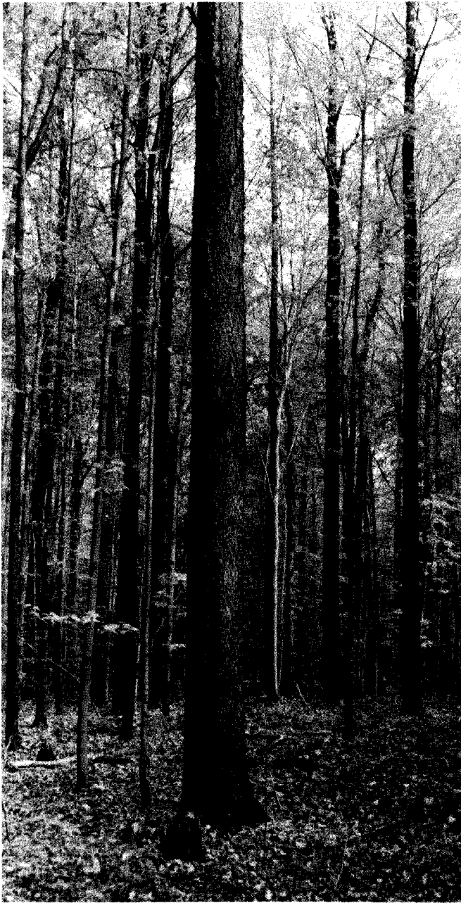
Figure 2—Black cherry.

Further southward throughout the Appalachian Highlands, black cherry generally grows on good to excellent sites as a scattered individual in association with other mesophytic hardwoods (36,74), and sometimes in nearly pure stands at high elevations on soils with impeded drainage. In the Lake States, black cherry prefers deep, well-drained soils and is adversely affected by increasingly poorer soil drainage (9).