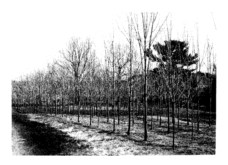
Figure 3-A young mixed plantation Of control-pollinated black and sugar maples and hybridsgrowing in Vermont.

Vegetative Reproduction-No information available.