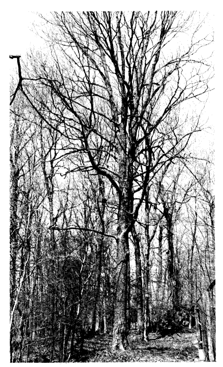
Figure 2-A mature black maple growing in a Vermont sugarbush.

In the Mixed Mesophytic climax forests in the Eastern United States, black maple appears as a dominant member in the forest canopy in association with American beech ( Fagus grandifolia ), yellowpoplar ( Liriodendron tulipifera ), American basswood ( Tilia americana ), sugar maple, yellow buckeye ( Aes culus octandra ), northern red oak ( Quercus rubra ), white oak ( Q. alba ), and eastern hemlock ( Tsuga canadensis ) (5).