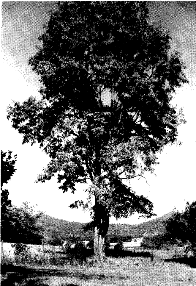
Figure 2—Black locust.

central Arkansas and southeastern Oklahoma. Outlying populations appear in southern Indiana and Illinois, Kentucky, Alabama, and Georgia (26). Black locust has been planted widely and has become naturalized throughout the United States, southern Canada, and parts of Europe and Asia.