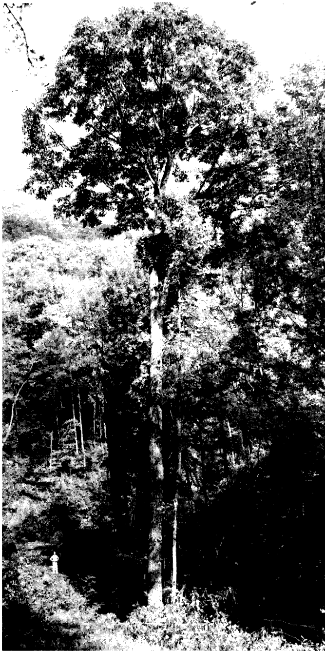
Figure 2-A mature northern red oak growing in the southern Appalachians at an elevation of 945 m (3,100 ft). The tree is 90 cm (35 in) in d. b.h. and 46 m (151 ft) tall.

aspen ( I? tremuloides ); American elm ( Ulmus americana ) and slippery elm ( U. rubra ); pignut hickory ( Carya glabra ), bitternut hickory ( C. cordiformis ), mockernut hickory ( C. tomentosa ), and shagbark hickory ( C. ovata ); scarlet oak ( Quercus