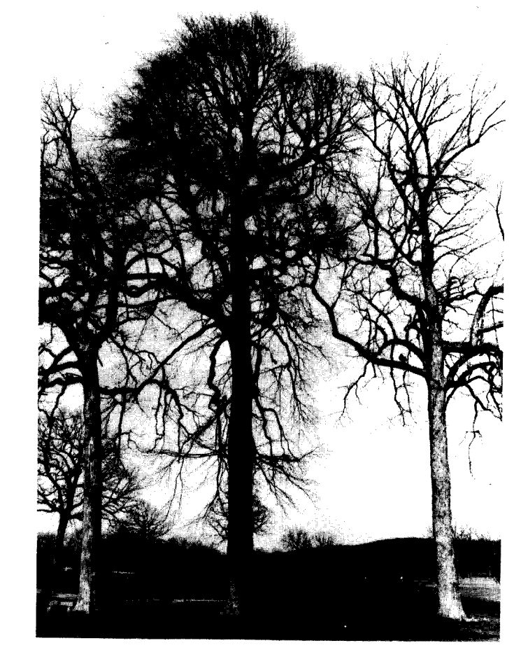
Figure 2—Black tupelo (center).

Seedling Development-Under natural conditions, seeds over-winter on cool moist soil and germinate in the spring. Germination is epigeal (2). Black tupelo requires nearly full light for optimum development. In a mature hardwood forest on a good site in Tennessee, 830 black tupelo/ha (337/acre)