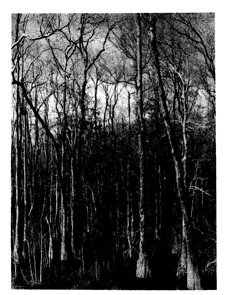
Figure 3-A swamp tupelo in the lower Coastal Plain Of South Carolina.

Mississippi Valley to southern Arkansas and west and south Tennessee (17).