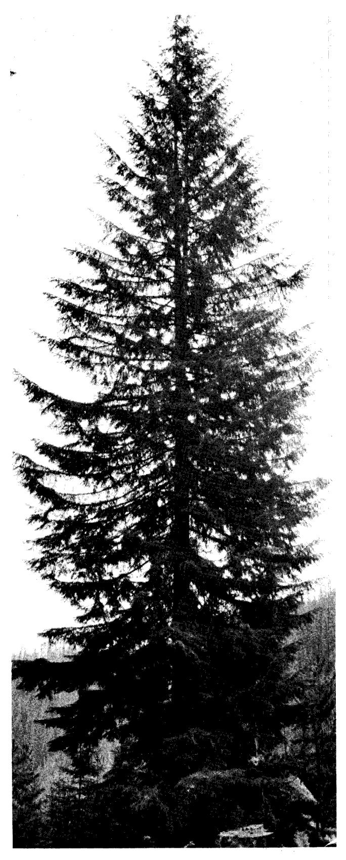
Figure 2-Open-grown western hemlock, Coeur d'Alene National Forest. ID.