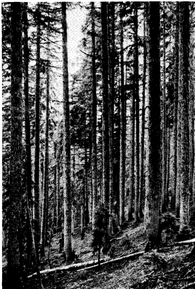
Figure 4 —Stands of noble fir are capable of prodigious growth in volume as in this 110-year-old stand at Wildcat Mountain Research Natural Area, Willamette National Forest, in the Cascade Range, OR. Volumes in this stand exceed 2100 \text{ m}^3/\text{ha} ( 150,000 \text{ fbm/acre} ).

(7,14) (fig. 4). Sustained height growth, high stand densities, a high form factor, and thin bark all contribute to the development of large volumes of trees and stands. Volumes of about 1400 \text{ m}^3/\text{ha} ( 100,000 \text{ fbm/acre} ) are indicated at culmination of mean annual increment on site class II lands (for example, site index 36 m or 119 ft at 100 years). In the grove at Goat Marsh Research Natural Area on the southwestern slopes of Mount St. Helens in Washington, the gross volume of the best contiguous 1-ha ( 2.47\text{-acre} ) block is 5752 \text{ m}^3/\text{ha} ( 82,200 \text{ ft}^3/\text{acre} or 407,950 \text{ fbm/acre} ); this value significantly exceeds the best gross volume for an acre of Douglas-fir. British yield tables for noble fir plantations indicate that yields from managed stands should also be high (2).