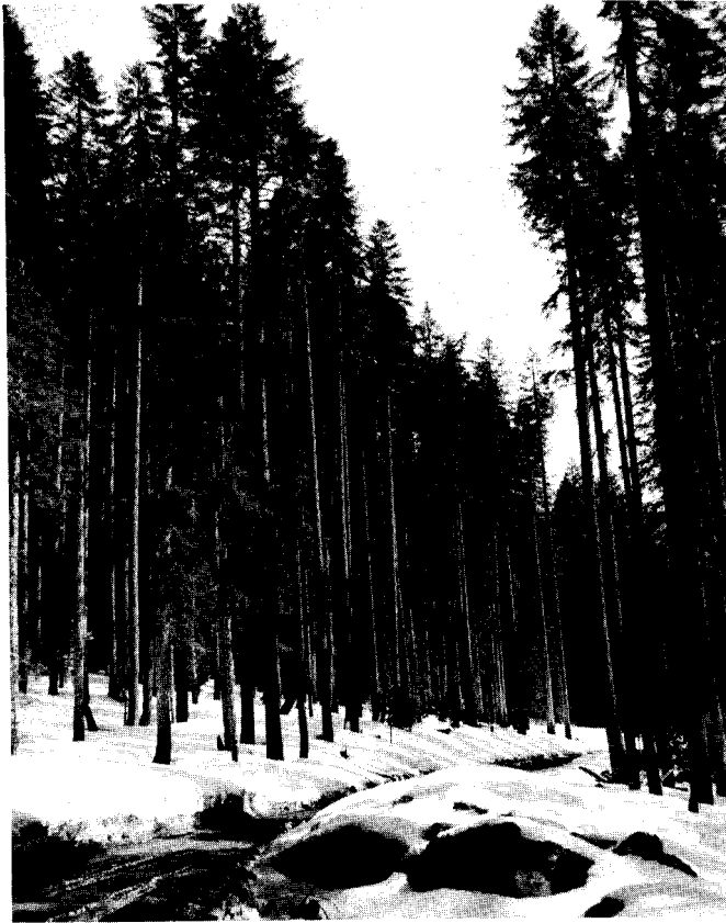
Figure 2 -Vigorous, almost pure young-growth stand of noble fir on the Willamette National Forest, OR, elevation about 1219 m (4,000 ft).

cm (3.3 in) tall at the end of the first growing season in the field, half the height of Douglas-fir seedlings planted at the same time. Damage from browsing was much less on noble fir than on Douglas-fir, however. In a test of containerized noble fir seedlings,