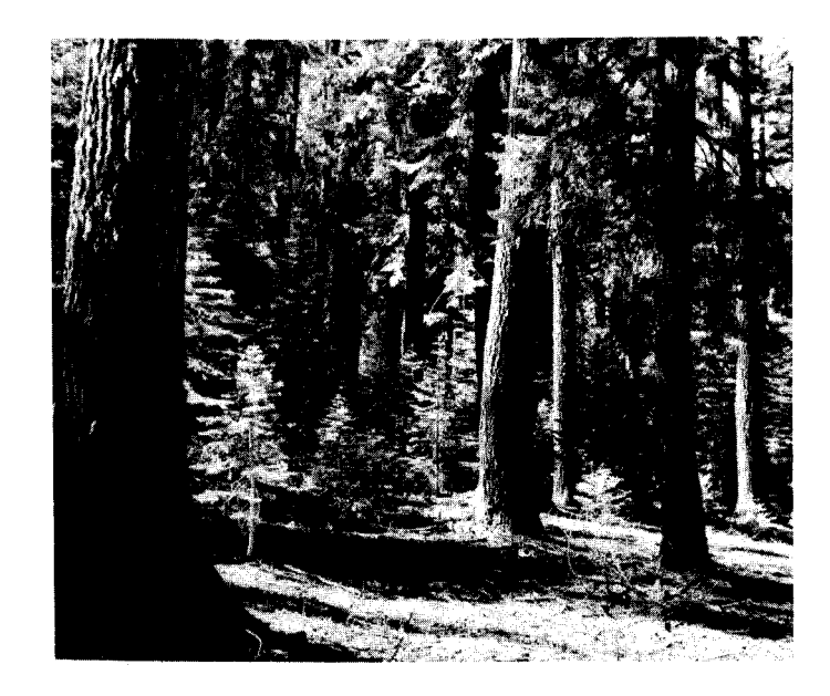
Figure 2 —Old-growth California red fir and California white fir forest at 1950 m (6,400 ft) in the southern Cascades. A lack of understory (right foreground) is common in mature stands on high quality sites. Trees regenerate naturally in small patches (left foreground) as the stand begins to disintegrate.

Tree growth and stand development are best on the deeper soils associated with glacial deposits or Pleistocene lake beds. On steep slopes where soils are shallowest, stands are open and tree growth poor. On moderate to gentle slopes and flat ground where water does not collect, stands are closed with no understory or herbaceous vegetation (8) (fig. 2).