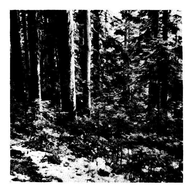
Figure 3-Old-growth stand of Pacific silver fir. Barring a major disturbance, the overstory slowly breaks up and the tolerant Pacific silver fir grows in the partial shade.

aged, old-growth forest with a major component of Pacific silver fir that will be self-perpetuating, barring a major disturbance (fig. 3). Pacific silver fir is referred to as the climax species at mid-elevations of its range (9) because of its ability to survive in the shade and to emerge in all-aged stands.