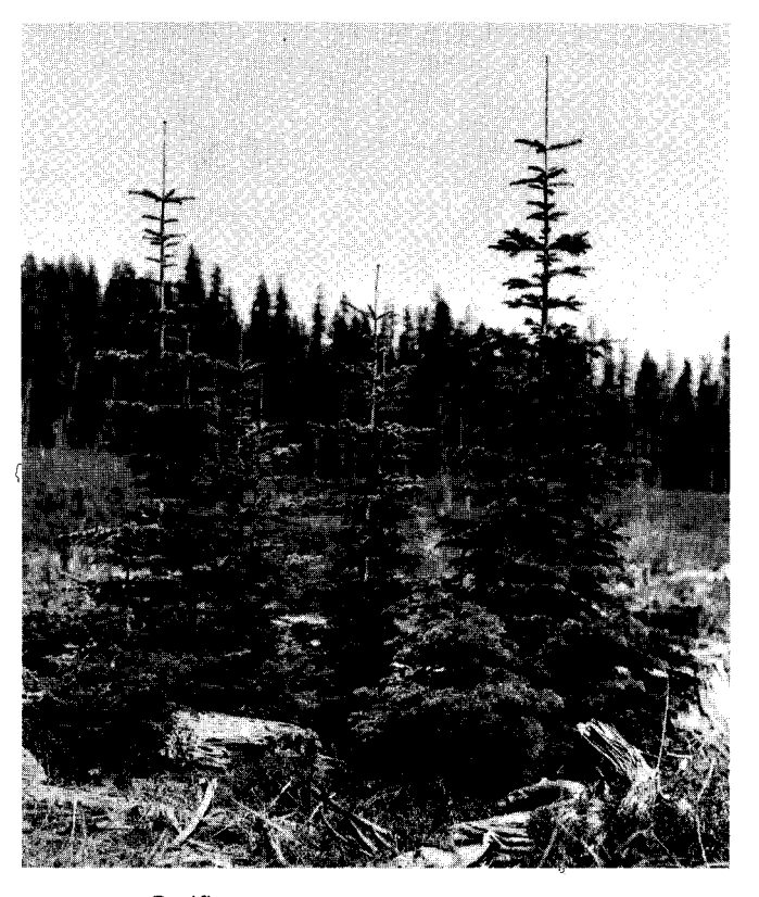
Figure 2-Pacific silver fir advance regeneration after release by clearcutting.

Eventually the overstory crowns abrade and let more light into the understory, allowing development of shrubs and advance regeneration. This may occur after one to three centuries-probably depending on site quality, spacing, and disturbance history-and has been observed to last to age 500 years ( 31 ). Individual overstory trees eventually die and advance regeneration grows slowly upward, creating a multi-