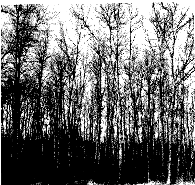
Figure 2—Black ash boles support small open crowns and are inclined to be poorly shaped.

Seedling Development —Because of dormancy, black ash seed does not normally germinate under natural conditions until the second year. In the nursery, ash seeds may be planted in the fall soon after they are collected and then mulched with burlap or straw until spring, and covered with 6 to 20 mm (0.25 to 0.75 in) of soil. Standard practice is to broadcast or drill seeds to achieve a nursery bed density of about 110 to 160 seedlings per square meter (10 to 15 ft). Germination is epigeal and usually occurs during the second year. Seedlings usually are outplanted as 1-O stock, sometimes 2-O in North America (12). Black ash seeds may remain viable for 8 years or more under natural conditions.