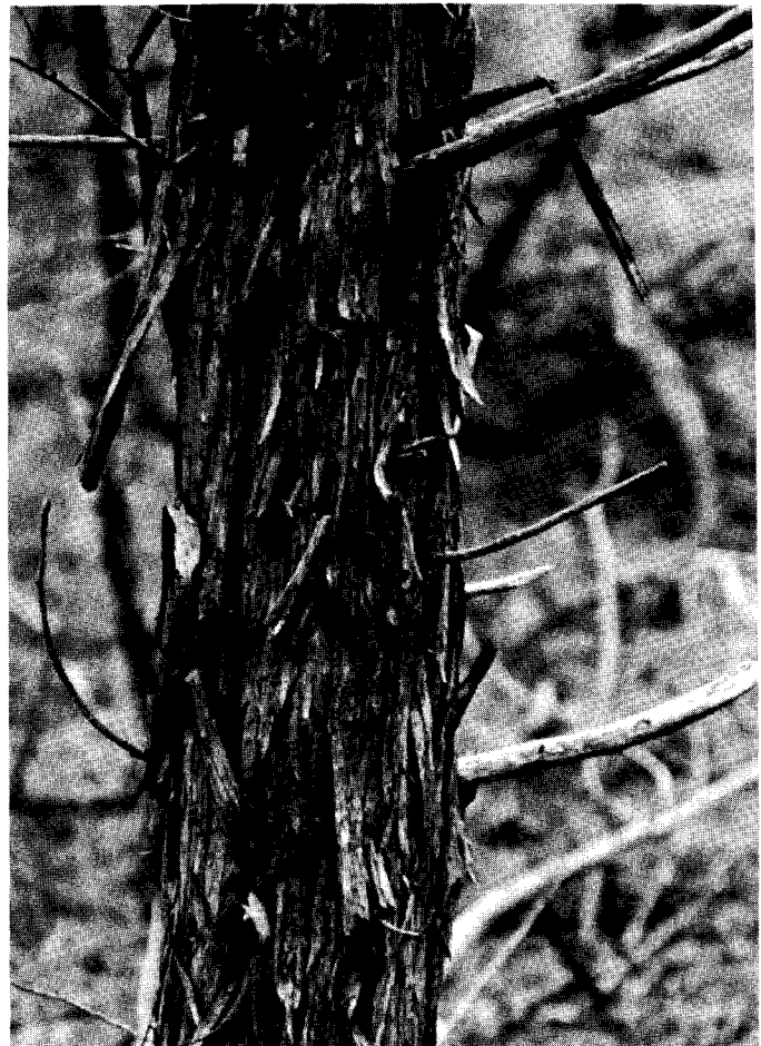
Figure 4—Fibrous, stringy bark, characteristic of mature Rocky Mountain juniper.

The seedlings, characterized by acicular foliage (sharp-pointed leaves) (fig. 3), develop slowly under natural conditions. They are reported to reach a height of 30 cm (12 in) in 8 years in northern New Mexico and Arizona. Their growth is more rapid in nurseries, where they often reach 15 cm (6 in) or more in 3 years. The preferred age for nursery stock for field plantings depends on the area and includes 2-0, 3-0, 1-1, 1-2, 2-1, or 2-2 stock. Potting or