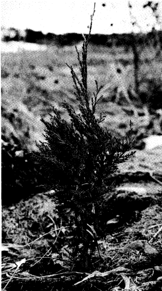
Figure 5—Three-year-old seedling, 30 cm (12 in) tall, showing immature, acicular foliage. This seedling was outplanted from 2-0 containerized stock. Under natural conditions, at least 8 years of growth are needed to reach this size.

Specific effects of passage through the digestive tract of a bird or animal on germination of Rocky Mountain juniper are not known; however, it could improve germination, as digestion acts as a scarification and acid treatment. A report on the pinyon—juniper type states that germination of juniper (species not indicated) was materially improved by such passage (30). Germination is epigeal (18).