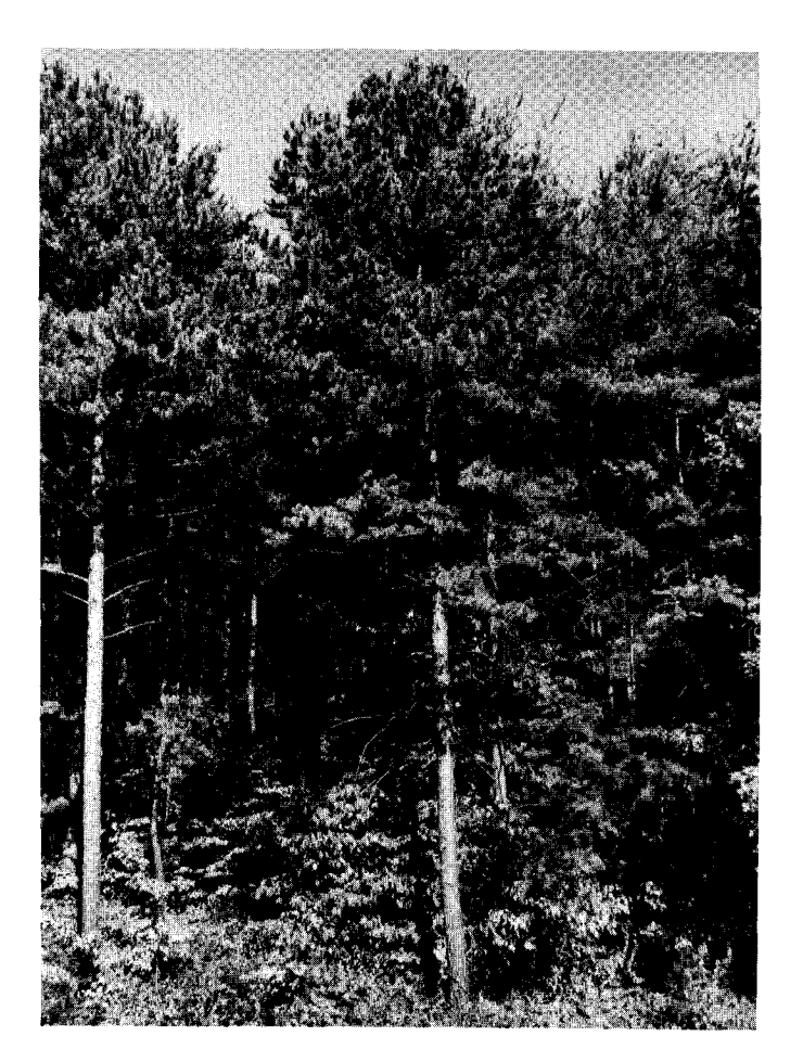
Figure 2-Virginia pine on the George Washington National Forest, VA.

Island, NY, and extends westward in scattered areas into Ohio, southern Indiana, and Tennessee.