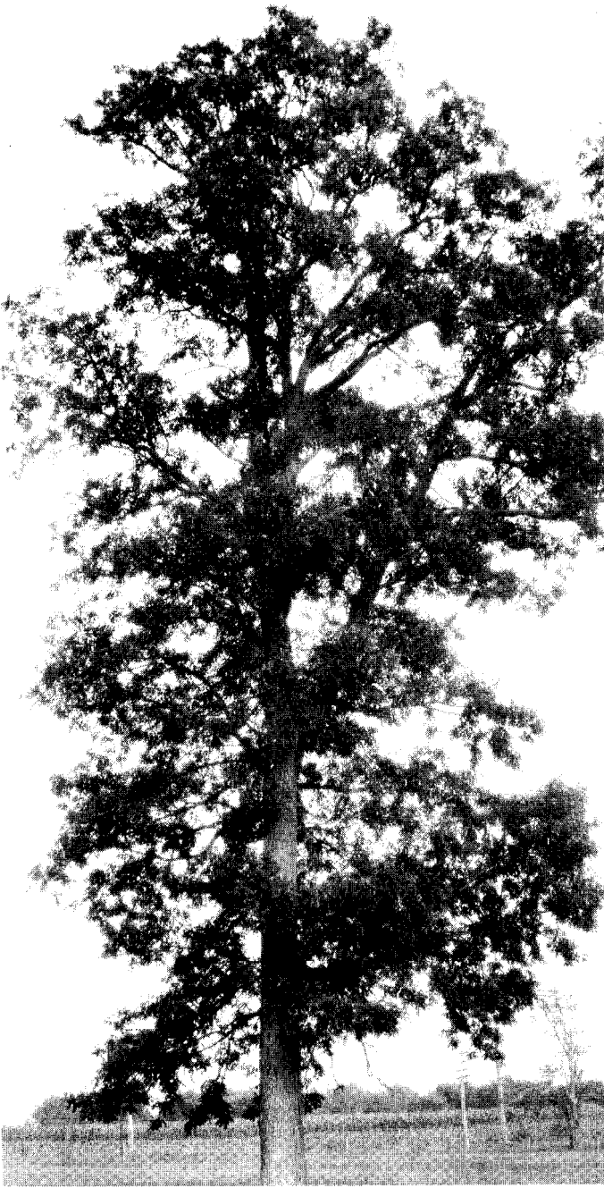
Figure 2—Bur oak.

the forest cover type Bur Oak (Society of American Foresters Type 42, eastern forests; Type 236, western forests) (6). It is also an important associate in six other types: Northern Pin Oak (Type 14), Aspen (Type 16), Black Ash-American Elm-Red Maple (Type 39), White Oak (Type 53), Pin Oak-Sweetgum (Type 65), and Hawthorn (Type 109).