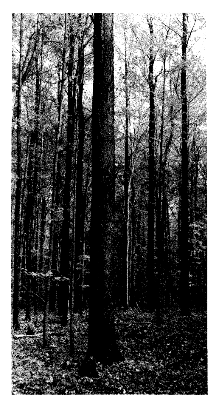
Figure 2—Black cherry.

Further southward throughout the Appalachian Highlands, black cherry generally grows on good to excellent sites as a scattered individual in association with other mesophytic hardwoods ( 36 , 74 ), and sometimes in nearly pure stands at high elevations on soils with impeded drainage. In the Lake States, black cherry prefers deep, well-drained soils and is adversely affected by increasingly poorer soil drainage (9).