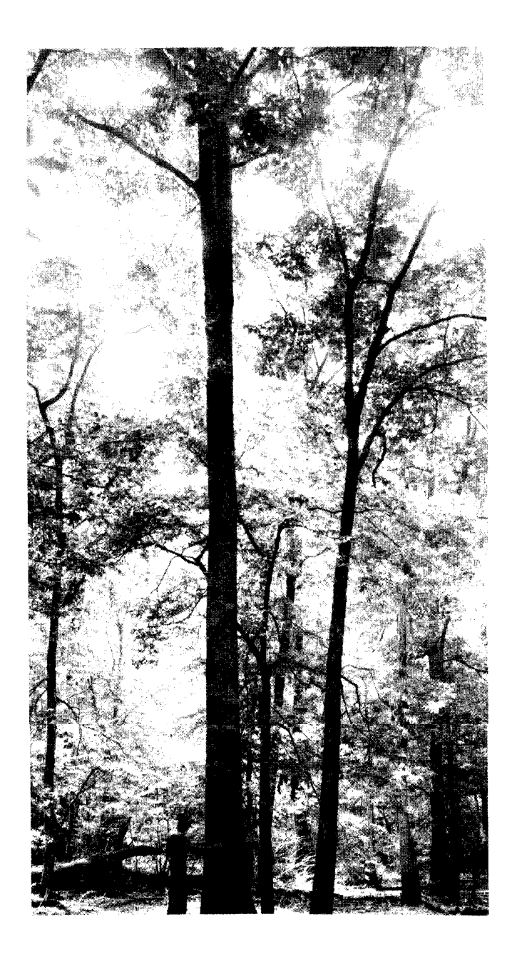
Figure 2—Nuttall oak growing on Dowling clay soil on the Tallahatchie National Forest in Mississippi.