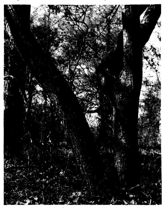
Figure 3-Two mature stems on a common stump of Carolina silverbell growing on the bank of the Ocmulgee River, Jones County, GA.

Growth and Yield-Over most of its range, Carolina silverbell (fig. 3) is an understory shrub or small tree usually reaching heights of 6 to 12 m (20 to 40 ft) with a crown spread of 4.5 to 9 m (15 to 30 ft) and stem diameters of 12 to 27 cm (5 to 11 in). On good sites in the Great Smoky Mountains, how-