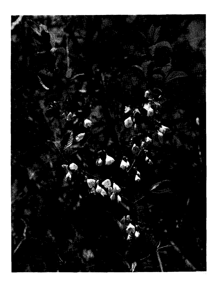
Figure 2—Foliage and flowers of Carolina silverbell.

a dry, oblong, four-winged drupe that matures in the fall.