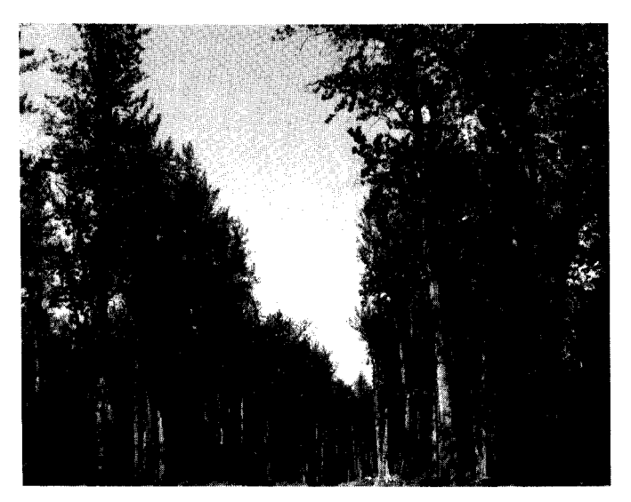
Figure 2—Mature balsam poplar stand growing at the confluence of the Chulitna and Susitna Rivers in south-central Alaska.

increase; (c) sulfate concentration, the major component of a salt crust common in early stages of succession, declines; and (d) depth and importance of the forest floor increases (51).