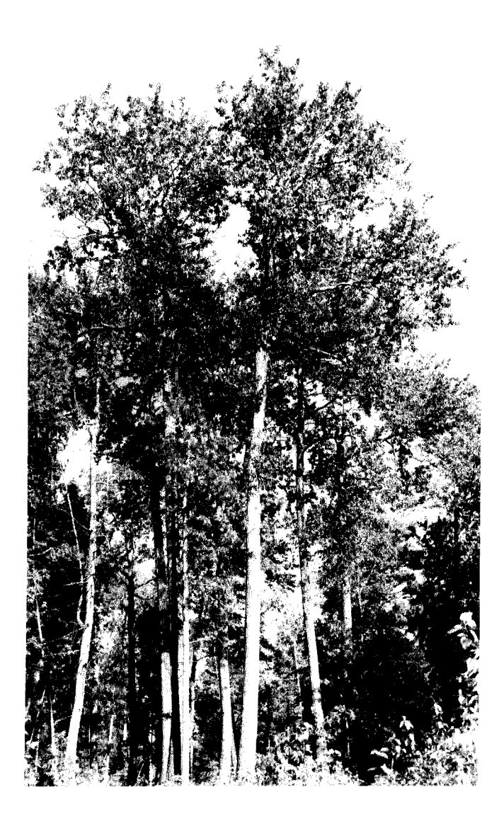
Figure 3-Mature balsam poplars 41 cm to 51 cm (16 to 20 in) in d.b.h. in Minnesota-bout 100 years old.

Balsam poplar stands are generally even-aged, with some variation. On upland sites in Saskatchewan, the greatest age span is about 17 years, but most stands have an age range of 5 years or less (10). Age spans are 20 to 25 years or less in young stands and 50 to 60 years in 155- to 165-year-old stands occupying flood plain sites in northeast British Columbia (40).