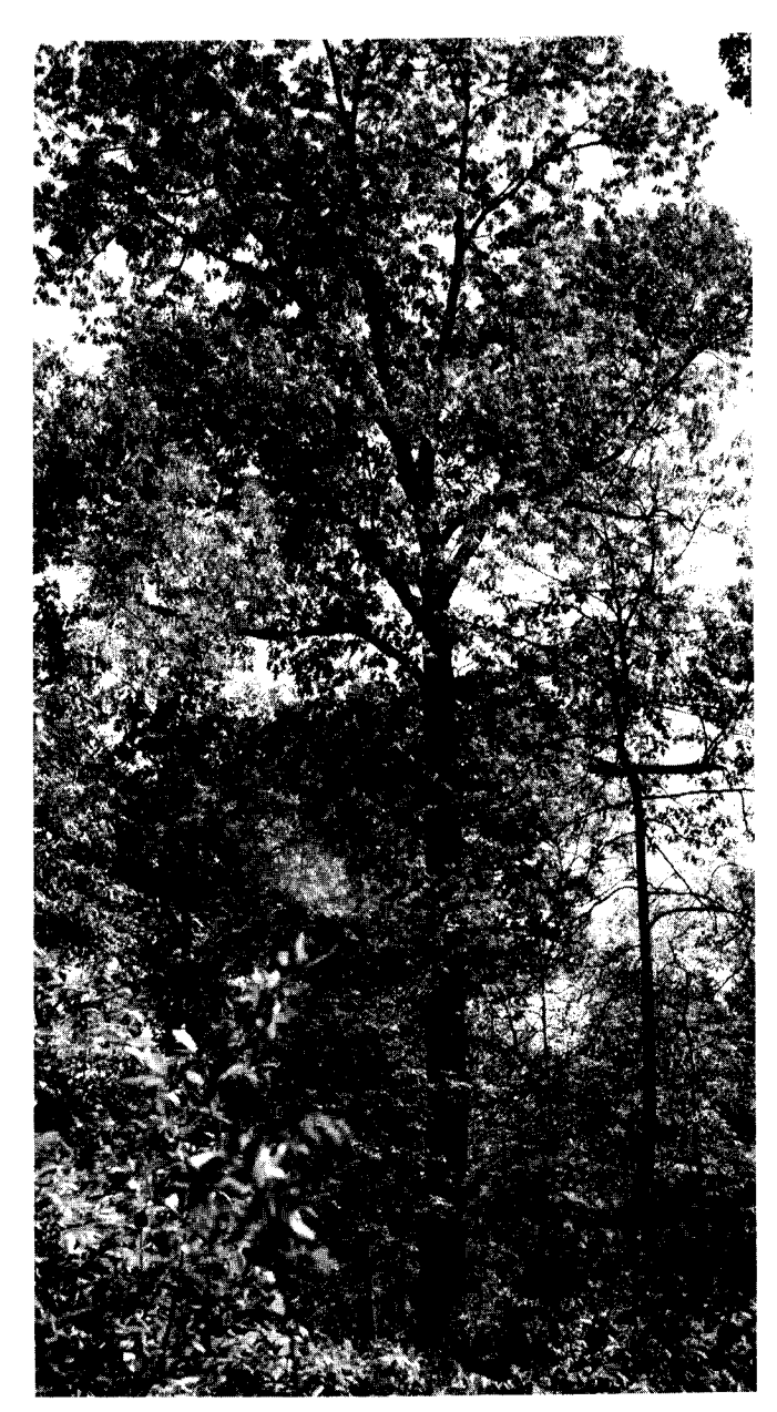
Figure 2-Black oak.

Flowering and Fruiting-Black oak is monoecious. The staminate flowers develop from leaf axils of the previous year and the catkins emerge before or at the same time as the current leaves in April or May. The pistillate flowers are borne in the axils of the current year's leaves and may be solitary or occur in two- to many-flowered spikes. The fruit, an acorn that occurs singly or in clusters of two to five, is about one-third enclosed in a scaly cup and matures in 2 years. Black oak acorns are brown when mature