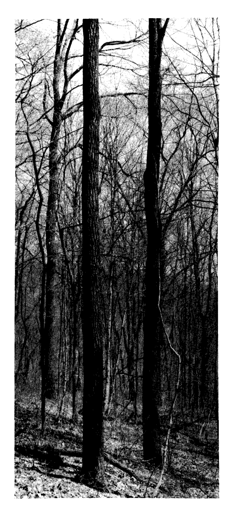
Figure 2—Veneer quality trees on a good site.

forest edge. Black walnut is a common associate in five forest cover types (16): Sugar Maple (Society of