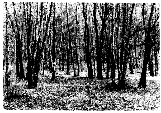
Figure 3 —Interior view of a natural 70-year-old California black oak stand of average stocking, density, and growth rate. Trees average 30 cm (12 in) in d.b.h, and more than 18 m (60 ft) in height.