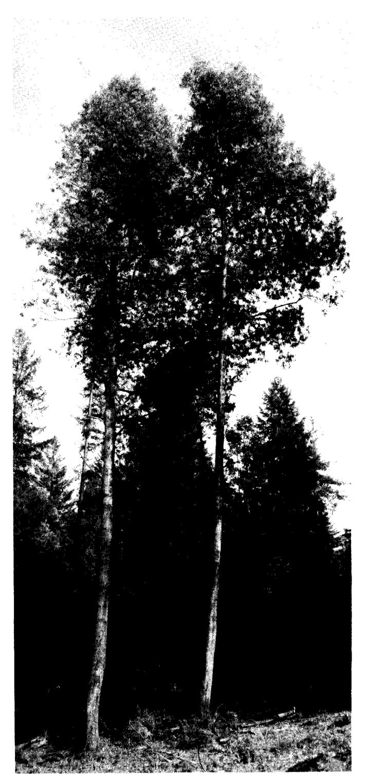
Figure 3-Mature tanoaks of medium size. The tree on the left is 51 cm (20 in) and the one on the right is 46 cm (18 in) in d.b.h.; both are 22.9 m (75 ft) tall.

Sprouts from burls grow rapidly in a wide range of environments. In clearcuts, they have reached 1.7 m (5.6 ft) the first year and 4.1 m (13.6 ft) after 5 years. The microclimate within sprout clumps is guite different from the microclimate immediately adjoining them (21). Sprout growth is reduced somewhat by a conifer overstory (13). The size of parent trees between 3 and 43 cm (1.3 and 16.8 in) in d.b.h. determined the height and diameter growth of sprout clumps, and the number of sprouts in a clump. The larger parent trees produced greater sprout development. Sprouts are reduced drastically in numbers early in their life and growth is concentrated on the dominant stems. In the first 15 or 20 years, sprouts grow an average of about 0.6 m (2 ft) in height a year. Often, a circle of four to eight slender 30-year-old poles grows around the stump of a parent tree. These poles may average 30 to 38 cm (12 to 15 in) in d.b.h. (24). Thinning all but 2 to 4 sprouts per clump of 3to lo-year-old sprout clumps did not increase height or diameter growth of the remaining sprouts, largely