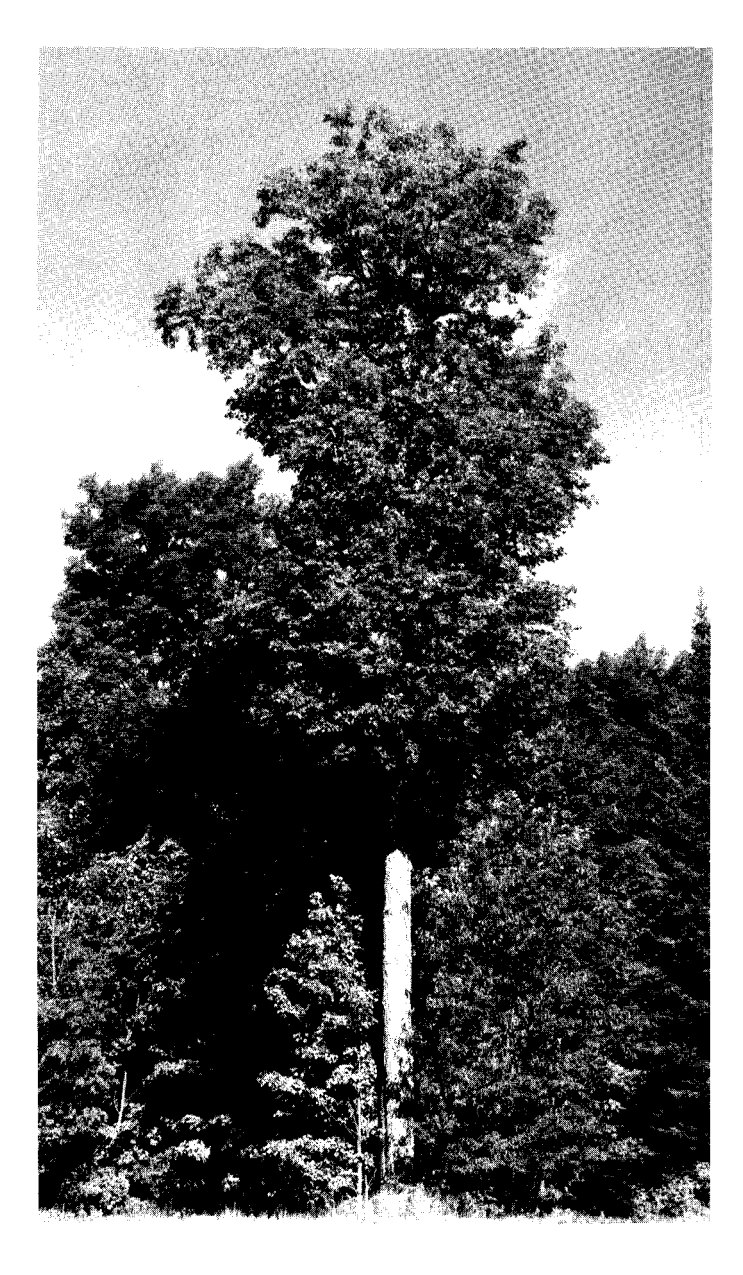
Figure Z-Sugar maple.

Mountains of Vermont and the White Mountains of New Hampshire, especially, the upper limit lies in a sharp horizontal band with a narrow transitional zone into the Boreal forest types. In the southern Appalachians the upper elevation ranges from 910 m (3,000 ft) to 1680 m (5,500 ft), with the lower levels generally restricted to the cooler north slopes. In the southern and southwestern parts of its range, sugar maple more typically grows on moist flats and along ravines at intermediate elevations in the rolling topography.