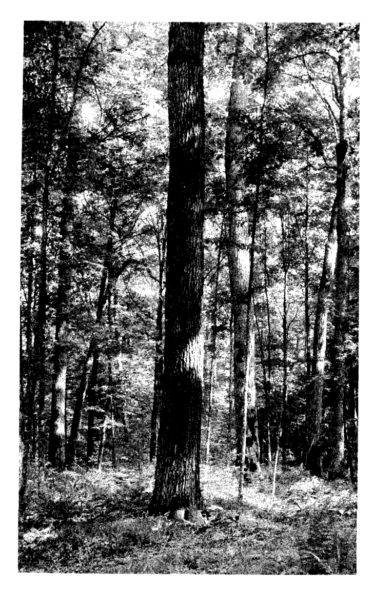
Figure 34 mature sugar maple stand in Nicolet National Forest, WI.

basal-area growth of up to 0.7 m<sup>2</sup>/ha (3 ft<sup>2</sup>/acre) is typical of young stands on good sites in the Lake States but varies with total basal-area stocking, distribution of trees by size class, and site (18). Improvement in grade and tree size should be the guiding principle in stand management because this factor contributes more to value increase than diameter growth under most conditions (41,75,105).