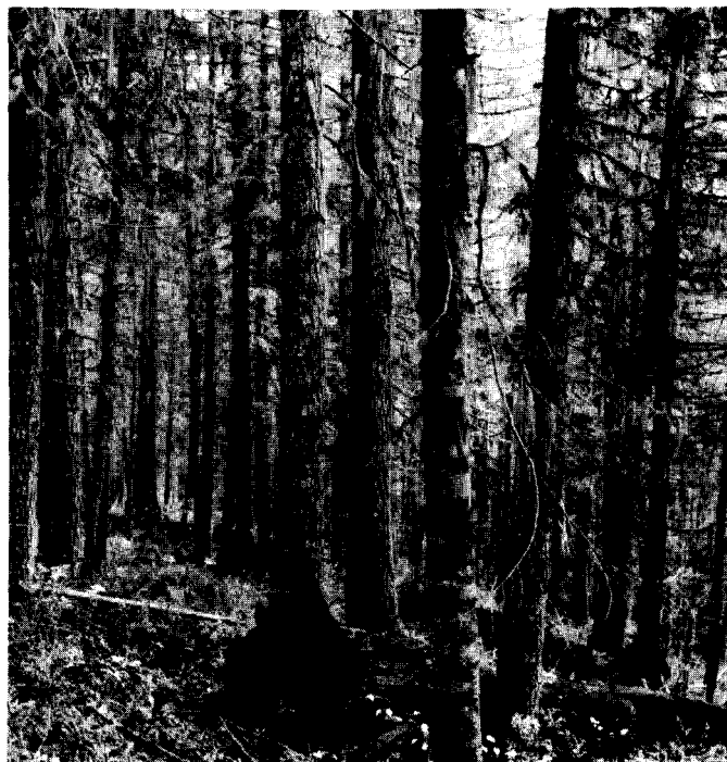
Figure 3-A 90-year-old grand fir stand. Coeur d'Alene National Forest, ID.

Grand fir has been planted successfully in many European countries, where it is considered one of the most potentially productive species (2). In England, growth of grand fir plantations was compared with that of neighboring plantations of other commonly planted species, and the rate of growth of grand fir at 40 years of age frequently equaled or exceeded