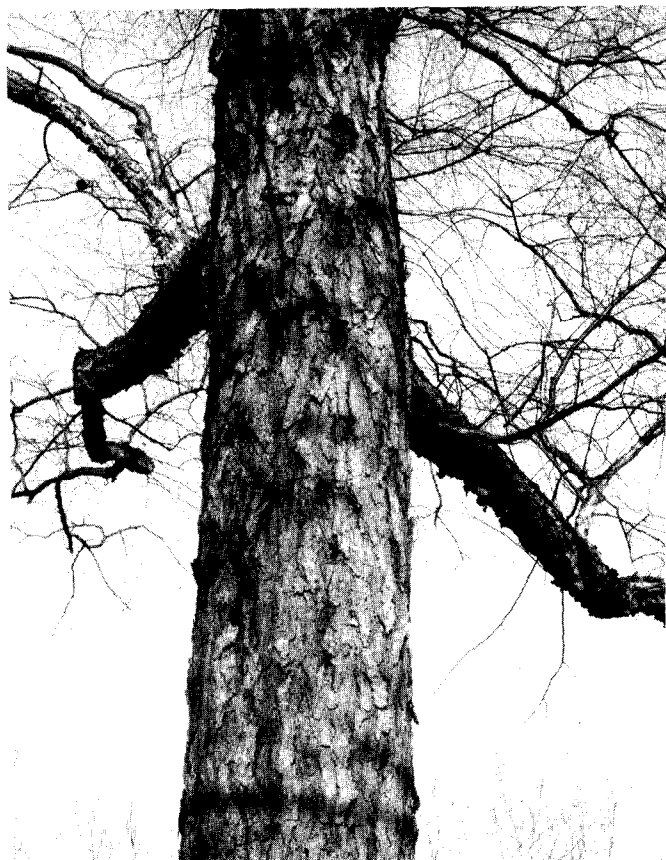
Figure 3—Bark of a large river birch at the Secrest Arboretum in northern Ohio.

sweet birch ( B. lenta ), gray birch ( B. populifolia ), paper birch ( B. papyrifera ), resin birch ( B. glandulosa ), and low birch ( B. pumila var. glandulifera ) and with the following introduced species: B. ermani Cham., B. raddeana Trautv., B. pendula Roth, B. pubescens Ehrh., B. platyphylla Sukachev, and B. maximowicziana Regel. Seed yield and viability have been low and growth has been poor. In general, crossing attempts are more likely to succeed if river birch is the female parent (2).