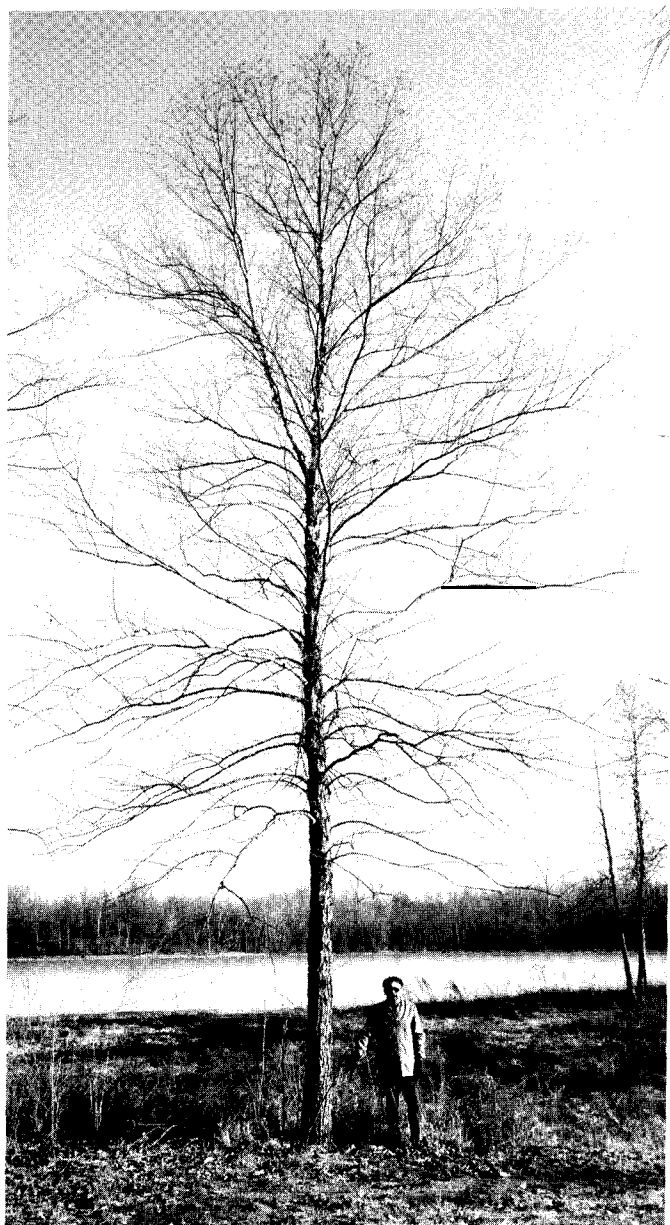
Figure 1 -River birch in winter on a natural site in Illinois.

bitter-nut hickory ( C. cordiformis ), mocker-nut hickory ( C. tomentosa ), hackberry ( Celtis occidentalis ), buttonbush ( Cephalanthus occidentalis ), American beech ( Fagus grandifolia ), swamp-privet ( Forestiera acuminata ), ash ( Fraxinus spp.), Carolina silverbell ( Halesia Carolina ), water-elm ( Planera aquatica ), eastern cottonwood ( Populus deltoides ), swamp cottonwood ( Populus heterophylla ), swamp white oak ( Quercus bicolor ), overcup oak ( Q. lyrata ), bur oak ( Q. macrocarpa ), swamp chestnut oak ( Q. michauxii ), pin oak ( Q. palustris ), northern red oak ( Q. rubra ),