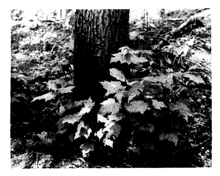
Figure 4-Red maple sprouts at base of tree 30 cm (1.2 in) in d. b. h. 2 months after a prescribed burn.

Vegetative Reproduction-Red maple stumps sprout vigorously (figs. 3, 4). Inhibited, dormant buds are always present at the base of red maple stems. Within 2 to 6 weeks after the stem is cut, these inhibited buds begin to extend (65). Fire can also stimulate these buds. The number of sprouts per