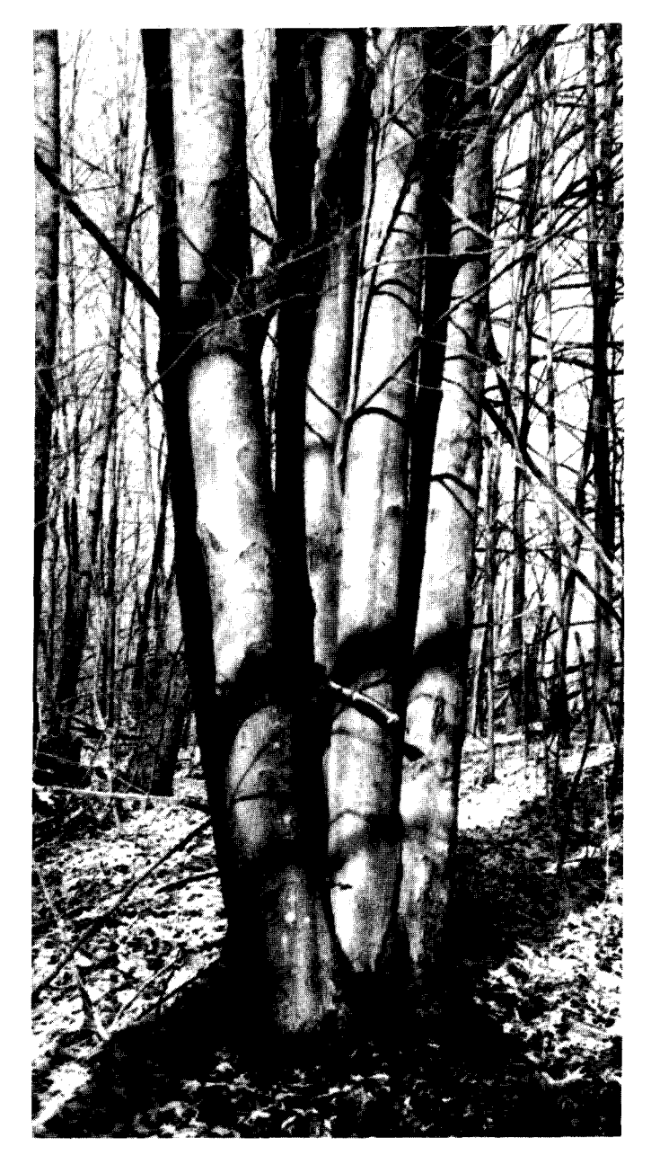
Figure 3-Clump of red maple stump sprouts.

ry leaves have been identified as a source of benzoic acid and as a potential allelopathic inhibitor of red maple (23).